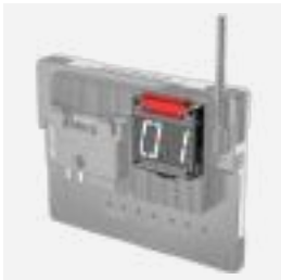
Camera ID & Tally Light