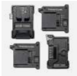
Micro Battery Plates