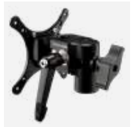
Ultra QR Monitor Mount