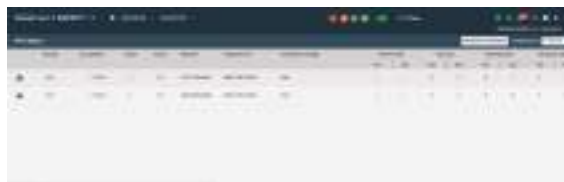
SDP vs Stream Comparison

Precision Time Protocol (PTP) is the foundation of synchronization within an IP Media network. Inspect 2110 continually monitors PTP on both primary and secondary networks providing information on the Grandmaster ID, message rates for announce, sync, delay request and delay response. The user can setup alarm templates for PTP to alert the user to a Domain Change, a Change in Grandmaster ID and select threshold for the various message rates.