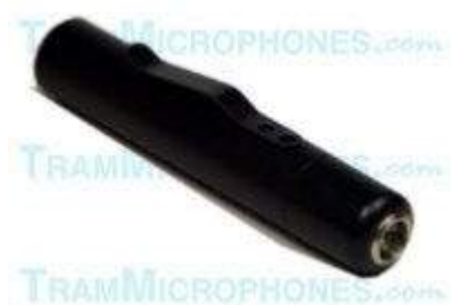
TR79ML Detachable Power Supply With TB5M Connector For Use With TRAM TR50 Mics Wired For Lectrosonics

Positive bias, operates on internal battery or external 12-