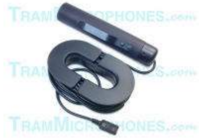
TR79 Power Supply Hard-Wired To TRAM TR50B Lavalier Mic

Connection between the TR50 and TR79 is through a connector of choice (from an extensive list), matching the connector used by an accompanying wireless transmitter if required.